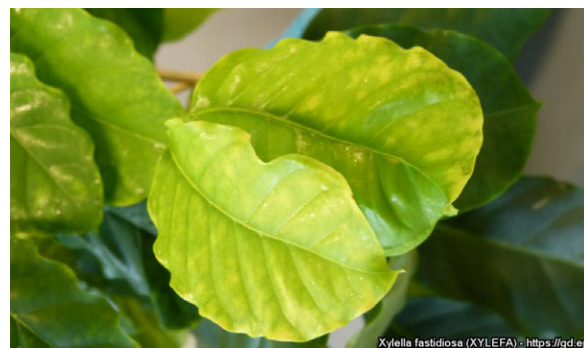
Fig. 8 ‘Crespera’ symptoms on Coffea sp., including curling of leaf margins, chlorosis and deformation (asymmetry).