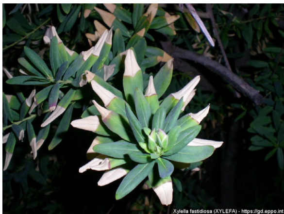
Fig. 18 Symptoms on Polygala myrtifolia .