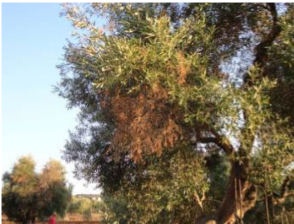
Fig. 10 Symptoms of quick olive decline syndrome.

eventually leading to desiccation (Fig. 9). Over time, symptoms become increasingly severe and extend to the rest of the crown, which acquires a blighted appearance (Fig. 10). Desiccated leaves and mummified drupes remain attached to the shoots. Trunks, branches and twigs viewed in cross-section show irregular discolouration of the vascular elements, sapwood and vascular cambium (Nigro et al. , 2013). Rapid dieback of shoots, twigs and branches may be followed by death of the entire tree. Xylella fastidiosa has also been detected in young olive trees with leaf scorching and quick decline.