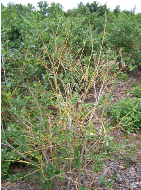
Fig. 3 Infected plants with yellow stems and a 'skeletal' appearance.

uniformly distributed throughout the foliage. Newly developed shoots can be abnormally thin with a reduced number of flower buds. Leaf drop occurs and twigs and stems have a distinct 'skeletal' yellow appearance (Fig. 3). Following leaf drop the plant typically dies during the second year after symptoms are observed (Chang et al. , 2009).