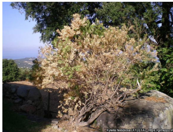
Fig. 19 Infected Polygala myrtifolia .