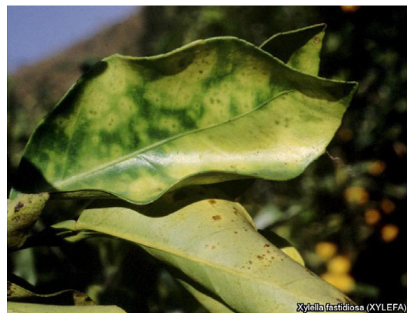
Fig. 4 Citrus variegated chlorosis (CVC): typical spots caused on sweet orange leaves.

Affected trees show foliar interveinal chlorosis on the upper surface, resembling zinc deficiency. Sectoring of symptoms in the canopy occurs on newly infected trees. However, citrus variegated chlorosis generally develops throughout the entire canopy on old infected trees. Affected trees are stunted and the canopy has a thin appearance because of defoliation and dieback of twigs and branches. Blossom and fruit set occur at the same time on healthy and affected trees, but normal fruit thinning does not occur on affected trees and the fruits remain small (Fig. 6), have a hard ring and ripen earlier. The plants do not usually die, but the yield and quality of the fruit are severely reduced (Donadio & Moreira, 1998). On affected trees of cv. Pera and other orange cultivars, fruits often occur in clusters of 4–10, resembling clusters of grapes. The growth rate of affected trees is greatly reduced and twigs and branches may wilt. Trees in nurseries can show symptoms of