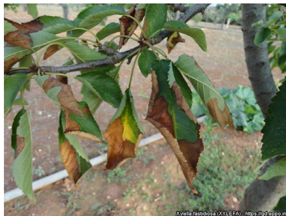
Fig. 20 Leaf scorch symptoms caused by Xylella fastidiosa on cherry.

Leaf scorching symptoms have been also reported on cherry (Fig. 20) in late summer/autumn in Italy.