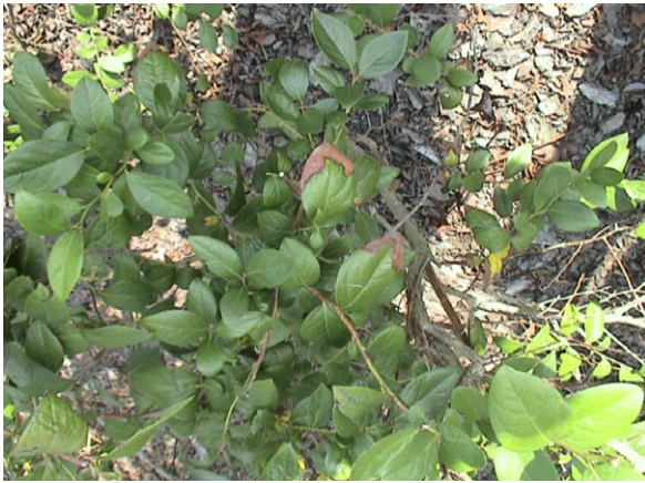
Fig. 2 Scorch symptoms with distinct leaf burn surrounded by a dark line of demarcation between green and dead tissue.