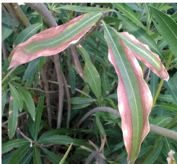
Fig. 17 Marginal leaf scorch symptoms caused by Xylella fastidiosa subsp. pauca on oleander.

Polygala myrtifolia is one of the major susceptible hosts in the current European outbreaks. Infected plants show scorched leaves, with desiccation starting from the tip and progressing to the entire blade (see leaf tip desiccation in Fig. 18). An infected plant is shown in Fig. 19.