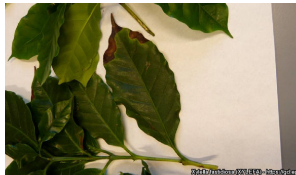
Fig. 7 Leaf scorch symptoms on Coffea sp.

Symptoms of coffee leaf scorch appear on new growth of field plants as large marginal and apical scorched areas on recently developed leaves (Fig. 7). Affected leaves drop prematurely, shoot growth is stunted and apical leaves are small and chlorotic. Symptoms may progress to shoot dieback. Infection of coffee plants by X. fastidiosa can also lead to the ‘crespera’ disease which was reported from Costa Rica (Fig. 8). Symptoms range from mild to severe curling of leaf margins, chlorosis and deformation of leaves, asymmetry (see Fig. 8), stunting of plants and shortening of internodes (Montero-Astúa et al. , 2008).