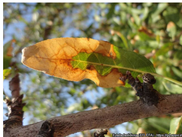
Fig. 1 Leaf scorch symptoms on almond.

Leaf scorching symptoms have been also reported on almond in late summer/autumn in Italy (Fig 1).