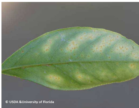
Fig. 5 Small raised lesions appear on the underside of leaves.