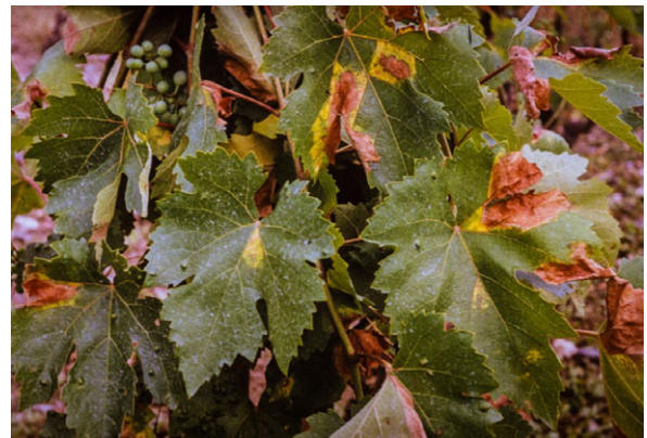
Fig. 12 Symptoms caused by Pseudopezicula tracheiphila .