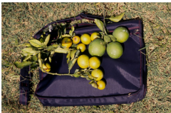
Fig. 6 Citrus variegated chlorosis (CVC): fruits are smaller and mature earlier (left) than fruits from healthy trees (right). Small raised lesions appear on the underside of leaves.

variegated chlorosis, as do trees older than 10 years. Young trees (1–3 years) become systemically colonized by X. fastidiosa faster than older trees. Trees older than 8–10 years are usually not totally affected, but rather have symptoms on the extremities of branches.