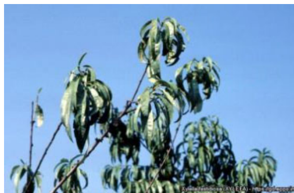
Fig. 15 Phony peach: typical 'phony peach' symptom on peach leaves caused by Xylella fastidiosa .

On infected peach trees, young shoots are stunted and bear greener, denser foliage than healthy trees (Fig. 15). Lateral branches grow horizontally or droop, so that the tree seems uniform, compact and rounded. Leaves and flowers appear early, and remain on the tree for longer than on healthy trees. Early in summer, because of shortened internodes, infected peach trees appear more compact, leafier and darker green than normal trees. Affected trees yield increasingly fewer and smaller fruits until, after 3–5 years, they become economically worthless. Fruits may also be more strongly coloured and will often ripen a few days earlier