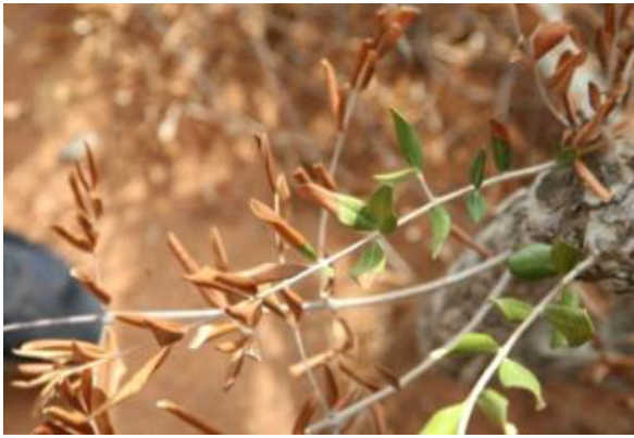
Fig. 9 Symptoms of quick olive decline syndrome.