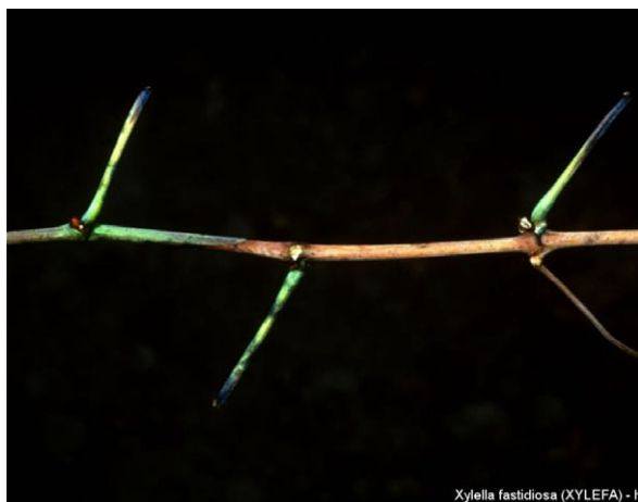
Fig. 13 Pierce's disease of grapevine: persistent petioles.