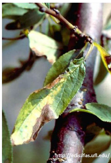
Fig. 16 Plum leaf scald: typical scorched symptom on plum leaf caused by Xylella fastidiosa . Reproduced from Mizell et al. (2015).

than normal. Infected peach and plum trees bloom several days earlier than healthy trees and tend to hold their leaves later into the autumn. The leaves of infected peach never display the typical of leaf scorching seen on infected plum trees. Symptoms of plum leaf scald on leaves are a typical scorched and scalded appearance (Fig. 16). Plum leaf scald also increases the susceptibility of the tree to other problems. Phony peach disease and plum leaf scald can limit the life of peach and plum orchards (Mizell et al. , 2015).