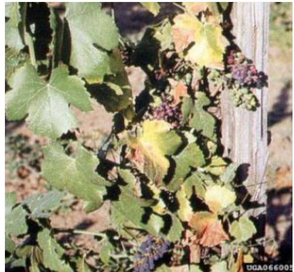
Fig. 11 Yellowing and desiccation of grapevine leaves and wilting of bunches in the Napa Valley, California (US).

Diseased stems often mature irregularly, with patches of brown and green tissue. Chronically infected plants may have small, distorted leaves with interveinal chlorosis (Fig. 14) and shoots with shortened internodes. Fruit clusters shrivel. In later years, infected plants develop late and produce stunted chlorotic shoots. Symptoms involve a